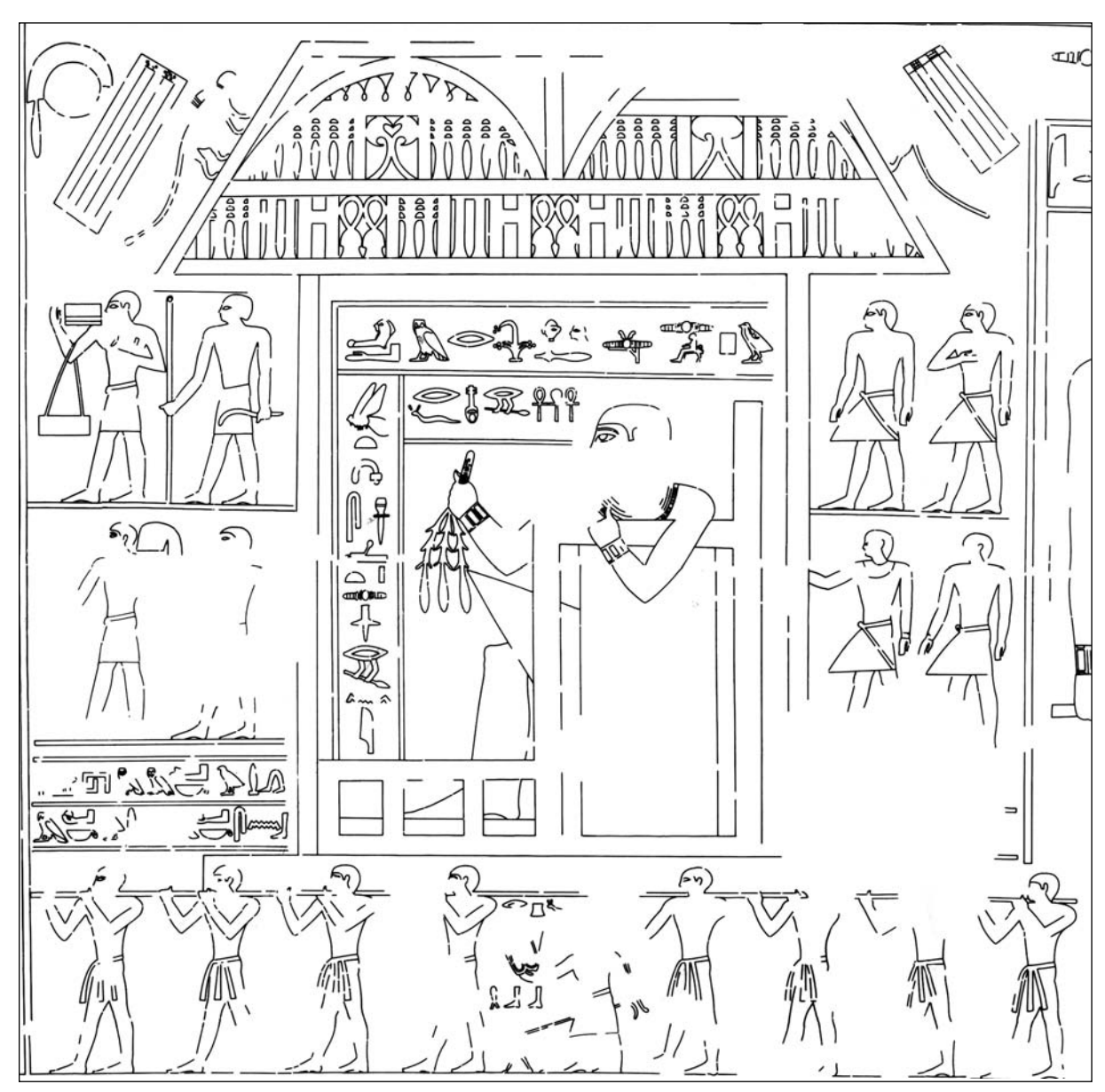
Figure 1: The carrying chair scene from the tomb of Shepsipu-Min/Kheni. (From Kanawati, el-Hawawish II, Fig. 21.

Tjeti's tomb also has a recess to the north, and west of it a northern wall that shows the tomb owner at a large scale, facing the recess. To his left, however, rather than a carrying-chair scene and a scene of musicians and marsh pursuits, the fragmentary remains show that a funeral was depicted. The upper register shows the procession to the cemetery, with the coffin in its shrine pulled by oxen, moving toward the west. The position and orientation of this procession is thus exactly the same as the position and orientation of the two carrying chair scenes in Kaihep and Shepsipu-Min. Figure 2 illustrates the similarity of these positions.